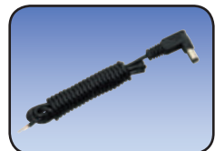
E-DC-6 12V Cable Without Adapter Plug