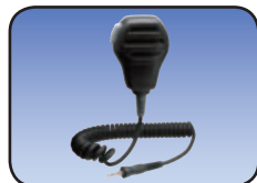
MH-73A4B Submersible speaker microphone