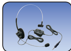
VC-24 VOX Headset