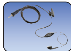
VC-27 Ear piece/Microphone