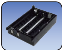
FBA-44 Alkaline Battery Case