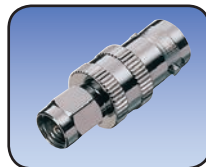
CN-3 Radio-to-Ship's-Antenna Adapter